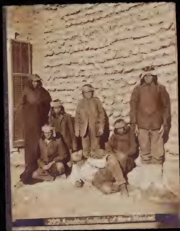
399 - Aodha's Island of New Zealand